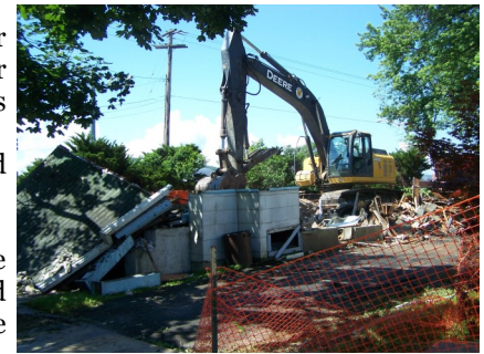
Demolition of dilapidated structure in Fairmont Park.