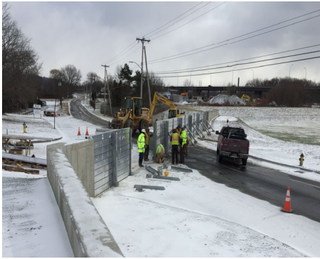
A new manually deployable flood closure system has been completed on Watson Blvd. near the former IBM Country Club.